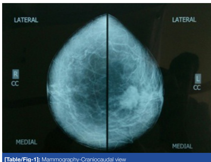
[Table/Fig-1]: Mammography-Craniocaudal view